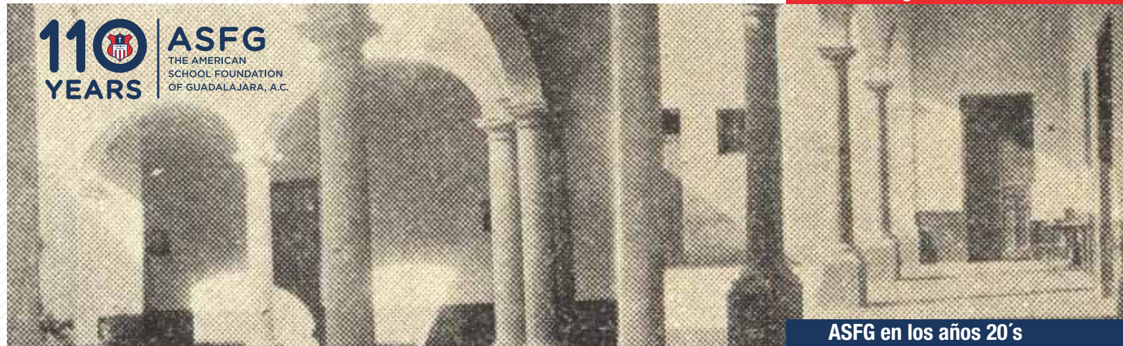
ASFG en los años 20's

As a learning community, we are committed to living by and reminding our community members of these ideas, because we know that our students will achieve more when they have a growth mindset.