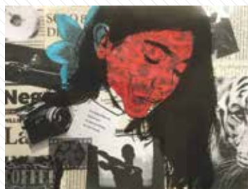
Messy = Being many things at once